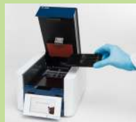
Place Plate in System