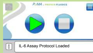
Run Your Assay